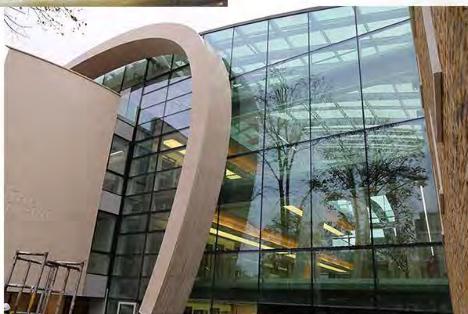
The New Fetal Medicine Centre - New build. Structural metalwork for building DM Steelwork carried out structural steelwork, staircases,