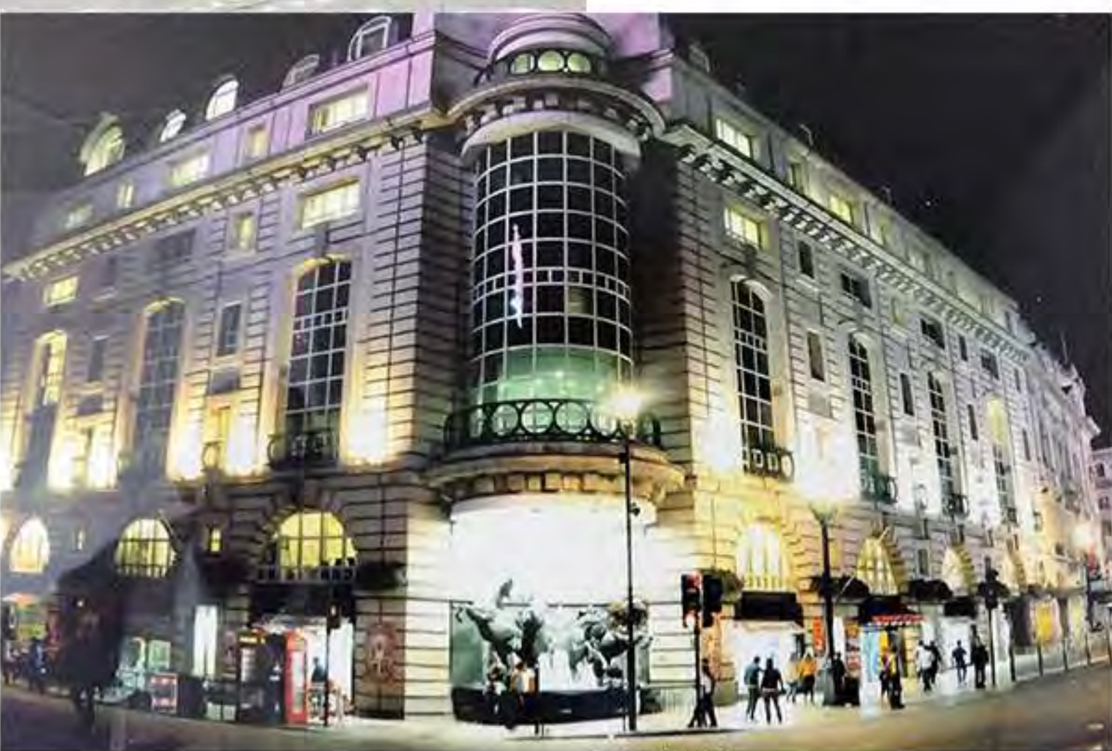
Trocadero - Structural metalwork for building refurbishment to make ready for new hotel to be completed in 2017/8.