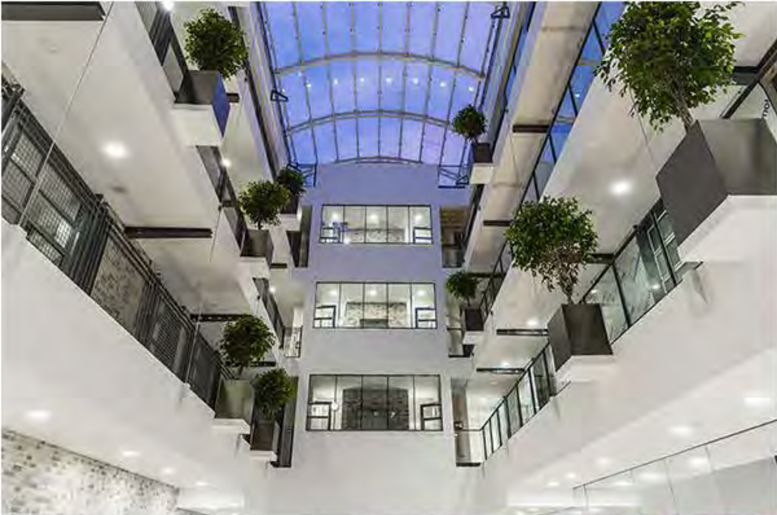
Carlow House - A wide range of services including glass balustrades, powder coated balustrades, staircases, structural walkways and planters.